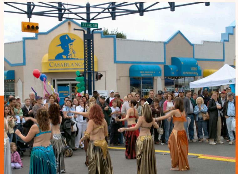
Who remembers Casablanca Video?