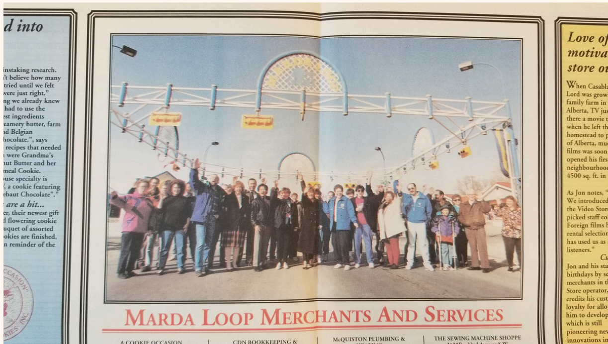
Marda BRZ Members Group Photo with new entryway sign circa 1990